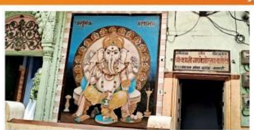
काशी गणेशोत्सव साजरा होणारा आंग्रे वाडा

दर्गा घाटालगतच्या या परिसरात सातशे 🎿 🚉 ते आठशे कुटुंवे महाराष्ट्रातील आहेत.