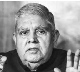
“POLICE @WBPOLICE @CPKOLKATA MUST END SENSELESS POLITICAL VIOLENCE, VANDALISM, ARSON, KILLINGS AND INTIMIDATION THAT SHAMES DEMOCRACY. WHY POST POLL VIOLENCE ONLY WB? WHY THIS ASSAULT ON DEMOCRACY?” JAGDEEP DHANKHAR West Bengal Governor

“Police @WBPolice @CPKolkata must end senseless political violence, vandalism, arson, killings and intimidation that shames democracy. Why post poll violence only WB? Why this assault on democracy?” the governor asked on the