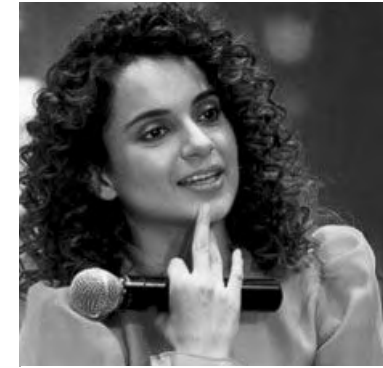
Actor Kangana Ranaut posted messages following the TMC win over the BJP and incidents of post-poll violence

like permanently suspending an account, it notifies people that they have been suspended for abuse violations, and explains which policy or policies they have violated and which content was in violation.