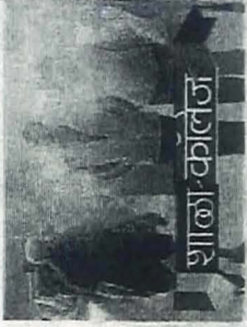
शाळा व कॉलेज

उत्तम आरोग्यासाठी रोज एक तास देण्याच्या सूचना